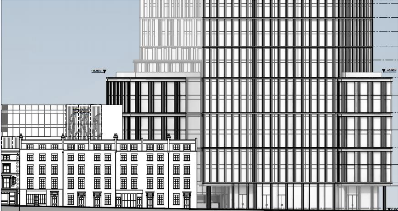
Sun Street Elevation